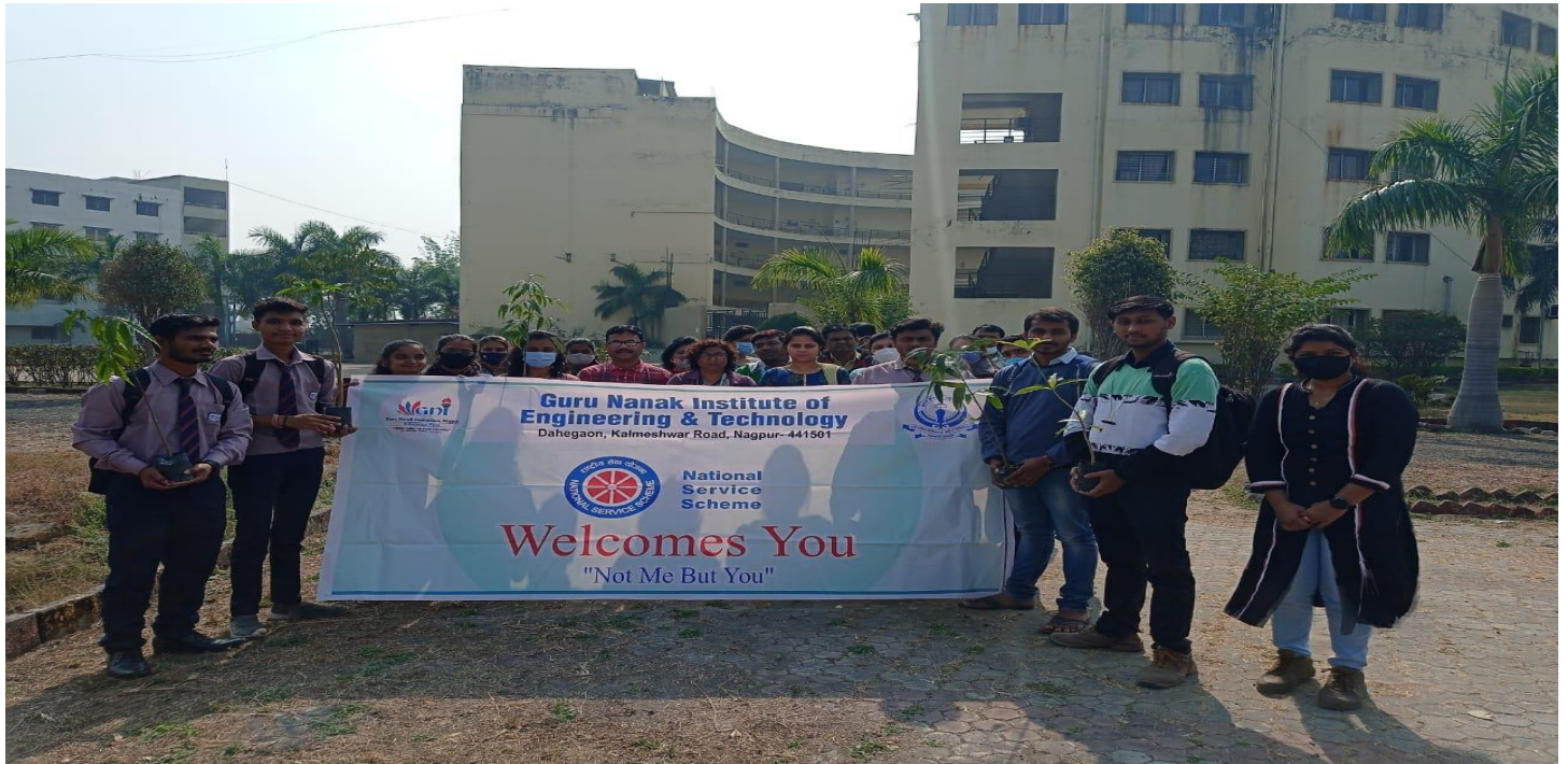
National Pollution Control Day on 03 Dec 2022

(MIC)' is the worst tragedy happened in the world so far.