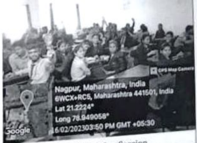
Hands on Training Session